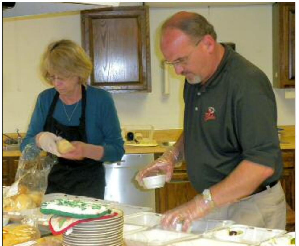
CHAMBER OF COMMERCE PHOTOS

St. Michael's Catholic Church serves between 50 and 100 people two days a week in its soup kitchen. Lunch is served every Tuesday and dinner on Thursday. The Craig Chamber of Commerce board of directors donated their time and Wal-Mart the ingredients to prepare dinner of lasagna, salad and garlic bread. Help is always needed in the soup kitchen. If you or your organization is interested in preparing a meal, contact St. Michael's Church.