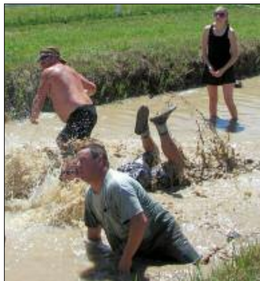
Twelve teams participated in the 2010 Chamber of Commerce Mud Splash mud volleyball tournament July 31. Right, the team from Mathers' Bar had no qualms about getting down and dirty. Above, a Back 9 player goes in face first to return a serve.