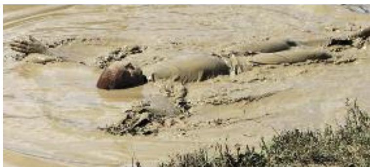
Above, one player practices his backstroke through the mud. Left, a crowd gathered to watch the event, bringing a camper and lots of coolers as they prepared to spend the day watching teams play in the mud. Several people even had pizza delivered to the site. This year's first-place trophy went to the team "We're from the Valley." Second place went to the Mud Sharks and Back 9 earned third place.