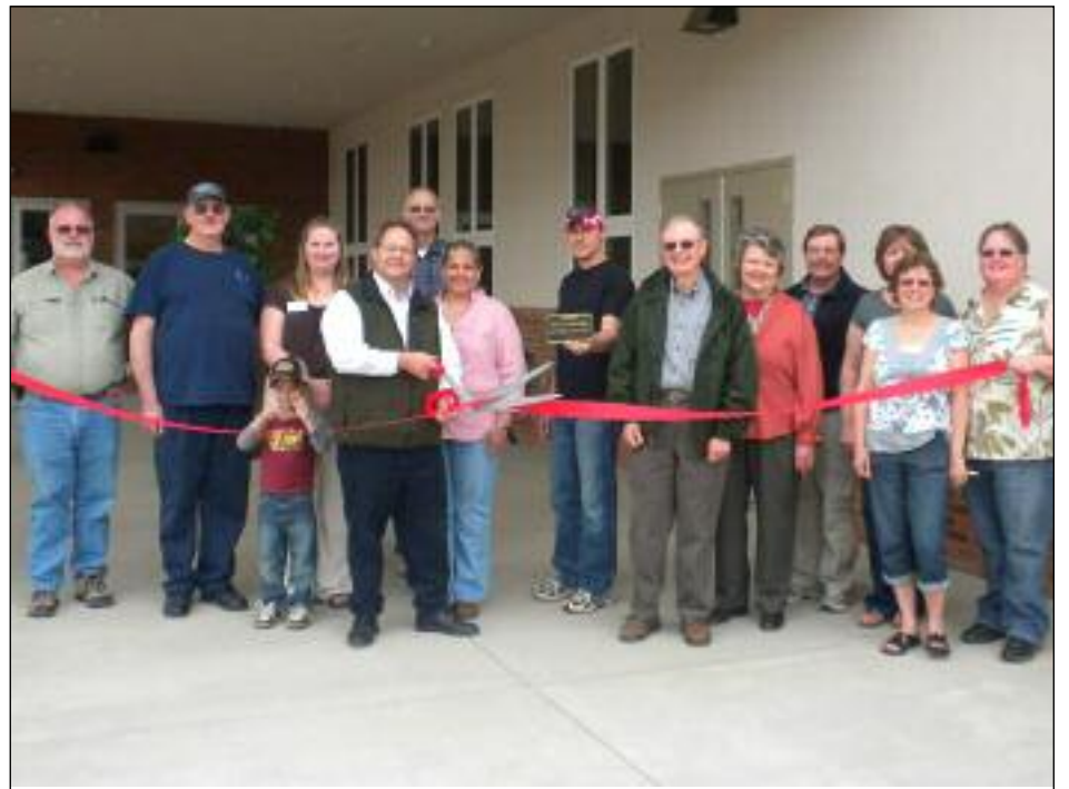
CHAMBER OF COMMERCE PICTURE

The Journey at First Baptist Church celebrated its grand re-opening this month following a major renovation. Be sure to see the changes at 1150 W. 9th St. or hear service times by calling (970) 824-3434. The Journey at First Baptist is a church helping people become fully-devoted disciples of Christ and loving God with all their heart, mind, strength, and soul; demonstrated by loving their neighbor.