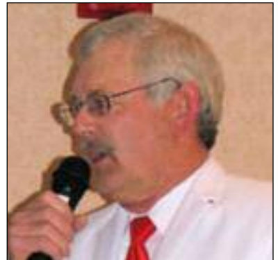
Mayor Don Jones