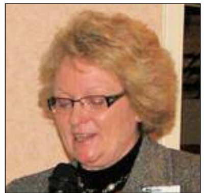
Commissioner Audrey Danner