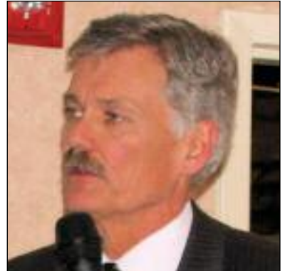
Sen. Al White